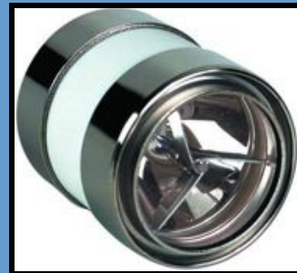
CeraLux Xenon Collimated Arc Lamp