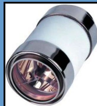
CeraLux Xenon Focused Arc Lamp

CeraLux xenon lamps produce broadband light with color temperatures of approximately 5900°K. This results in excellent white light for photopic, video and photographic applications.